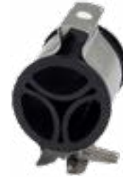
Butterfly Cushion Hanger