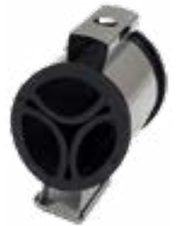
Clip-on Cushion Hanger

Typical Stackable and Snap-in Cushion Hanger Installation with Hardware for round member and angle member