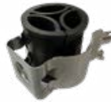
Stackable Snap-in Cushion Hanger