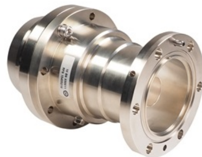
318EIA Connector for HCA400 Cable