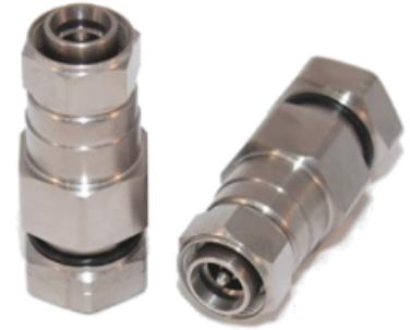
OMNI FIT™ Premium Connectors