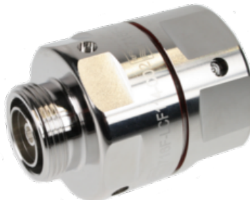
OMNI FIT<sup>™</sup> Standard Connectors