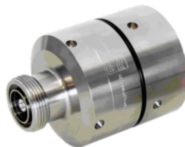
OMNI FIT™ Premium Connectors