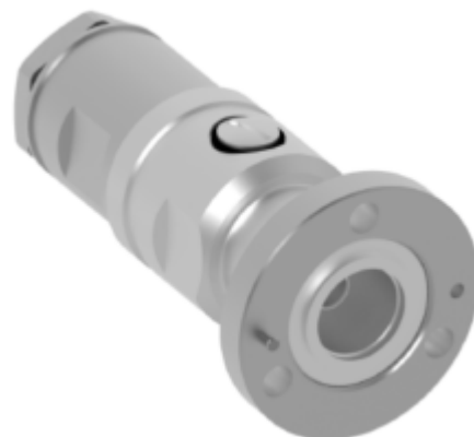
78EIA Connector for HCA78 Cable