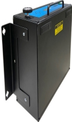
BD210WLP-V / BD212WLP-V