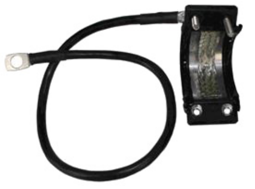
GKSPEED20-78C shown for illustration