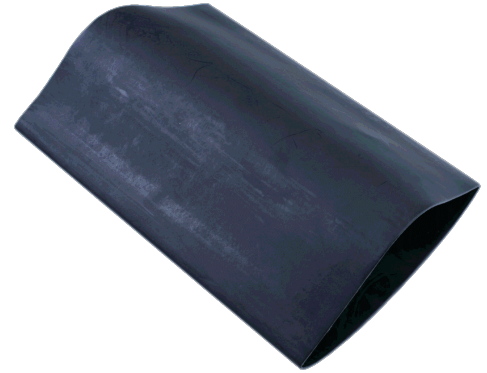
1pcs shrink tube out of pack of 20