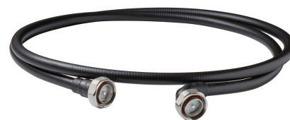
7M7MRL12F-0300FFP for EXAMPLE