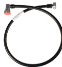
7M7MRL38-0100FFP for EXAMPLE