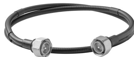
f. e. 43M43MS14-0100FFP