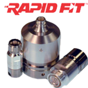
RAPID FIT™ Connectors