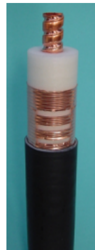
picture shows generic slot pattern