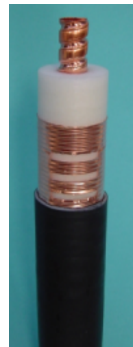
picture shows generic slot pattern