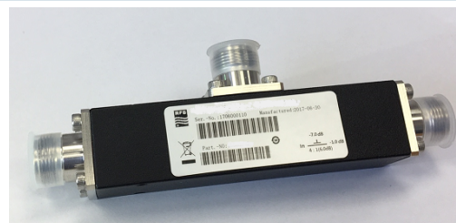
TPS10-43-694/3800 (similar product illustration)