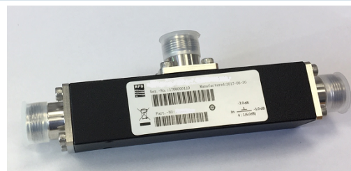
TPS13-43-694/3800 (similar product illustration)