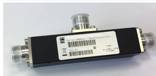
TPS15-43-694/3800 (similar product illustration)