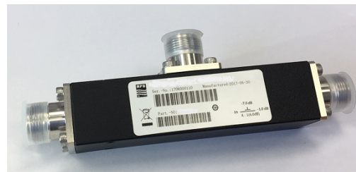
TPS20-43-694/3800 (similar product illustration)