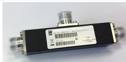
TPS20-43-555/6000 (similar product illustration)