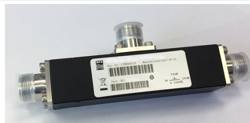
TPS30-43-694/3800 (similar product illustration)