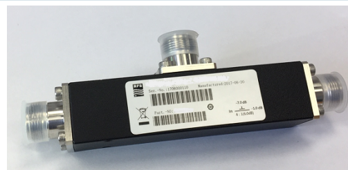
TPS6-43-555/6000 (similar product illustration)