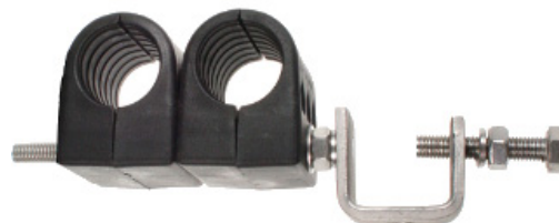
picture shows MBHS78-2-F for illustration purpose