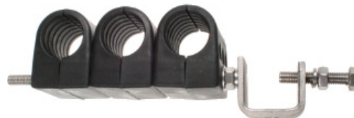
picture shows MBHS78-3-F for illustration purpose